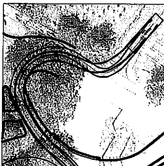
Fire Truck Access (largest mutual aid truck)

Note: Not all pedestrian and bicycle facilities shown