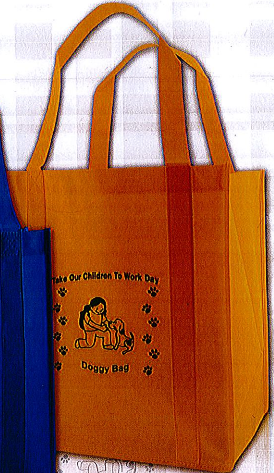
13 x 10 x 15