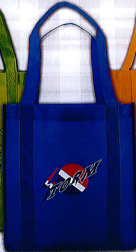
12 x 8 x 13