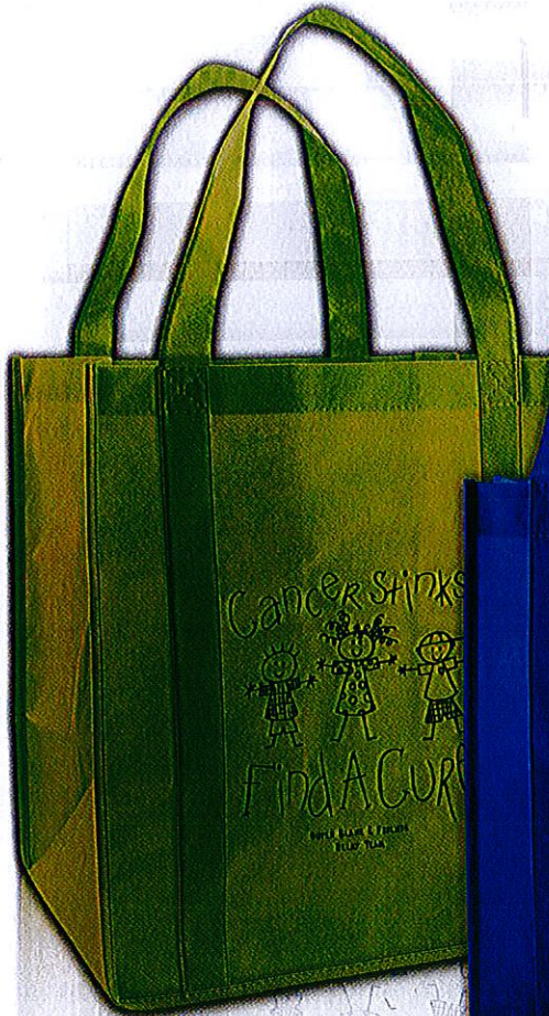
13 x 10 x 15