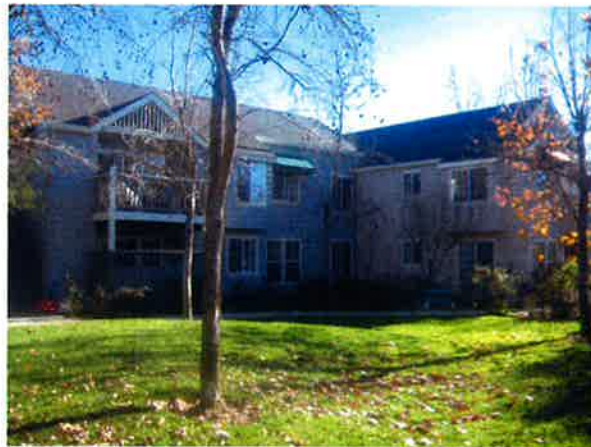
An example of Calistoga’s multi-family housing

1 Single unit - attached is defined by the DOF as a one-unit structure attached to another unit by a common wall, commonly referred to as a townhouse, half-plex, or row house. The shared wall or walls extend from the foundation to the roof with adjoining units to form a property line. Each unit has individual heating and plumbing systems. It is differentiated from a two-plex, in which the units share attic space, and heating and plumbing systems.