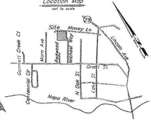
Location Map not to scale

Basis of Bearings: S 30°01'30" W 909.75' Being the monumented centerline of Michael Way between found 3" Brass Caps with punch in standard street well monument casing as shown on that "Parcel Map Of The Lands Of Patrick Brogan, ET UX" filed in Book 14 of Parcel Maps, at Pages 44 & 45, Napa County Records.