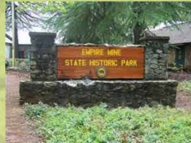
Empire Mine State Historic Park