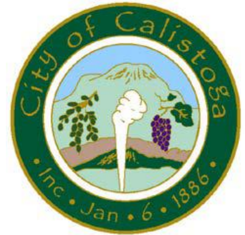
CURRENT CITY SEAL