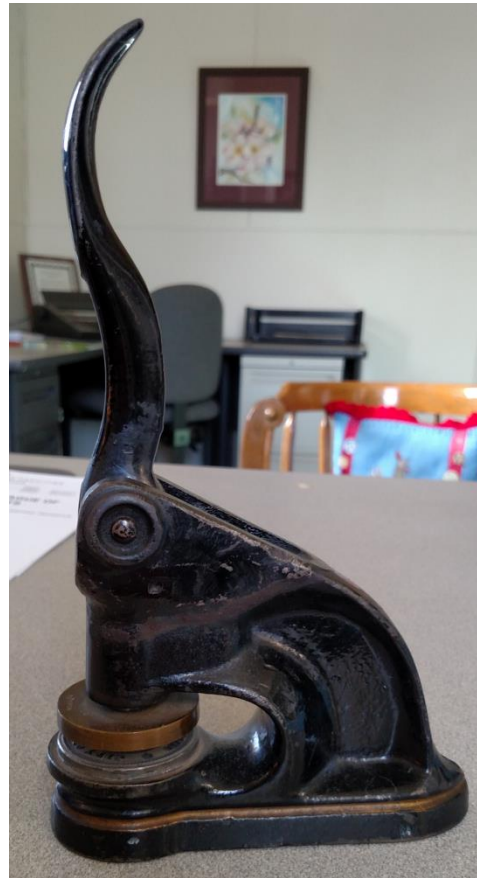
CURRENT SEAL EMBOSSE