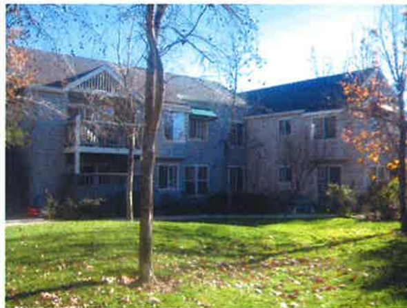
An example of Calistoga's multi-family housing

1 Single unit - attached is defined by the DOF as a one-unit structure attached to another unit by a common wall, commonly referred to as a townhouse, half-plex, or row house. The shared wall or walls extend from the foundation to the roof with adjoining units to form a property line. Each unit has individual heating and plumbing systems. It is differentiated from a two-plex, in which the units share attic space, and heating and plumbing systems.