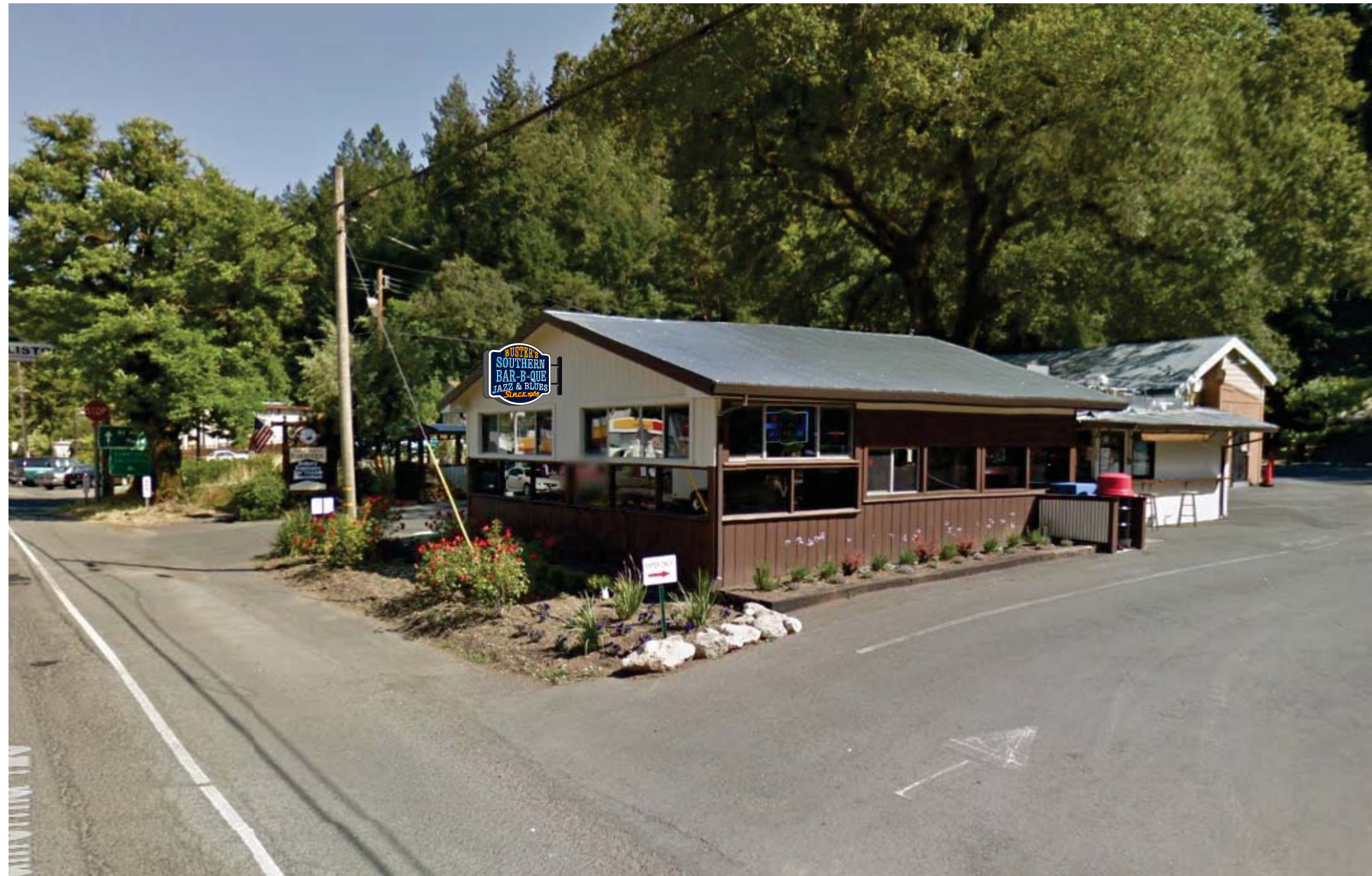
C Proposed Location Scale: NTS