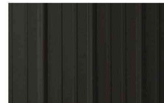
MTL-1 METAL (ROOFING) AEP SPAN METAL ROOF "DARK GRAY"