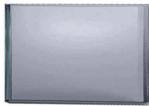
GLZ-1 GLAZING GUARDIAN DECO HT CLEAR