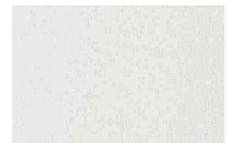
P-1 PAINT (FASCIA) SHERWIN WILLIAMS COLOR MATCH "MTL-1"