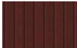
CB-1 HARDI BOARD PANELS WITH VERTICAL BATTENS AT 4'-0" O.C.