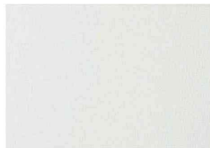
P-3 PAINT WOOD TRIM SHERWIN WILLIAMS "ALABASTER" SW7008