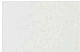
WC-1 WOOD CLAD WINDOW AND DOOR SYSTEM MARVIN PRE FINISHED "STONE WHITE"