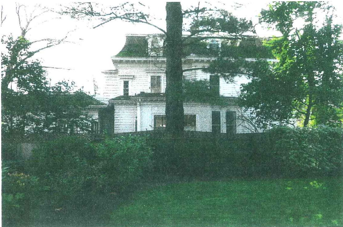
West side elevation of house from Pioneer Park. "Notch" at left to be filled in with small addition. Fence in foreground to be replaced