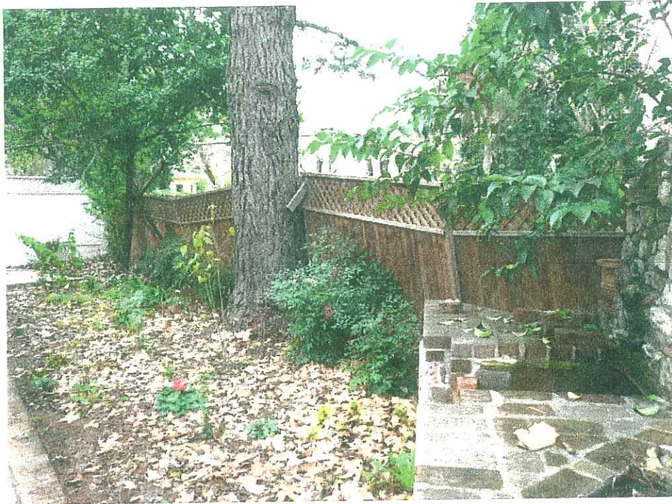
Another view of fence adjacent to Pioneer Park to be replaced, subject to design approval and cost-sharing agreement with City of Calistoga