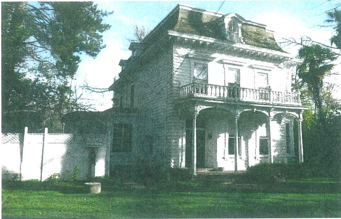
Front elevation from near Pioneer Park. Fence at left will be replaced with similar fence moved toward rear, to line up with dining room window on left of house