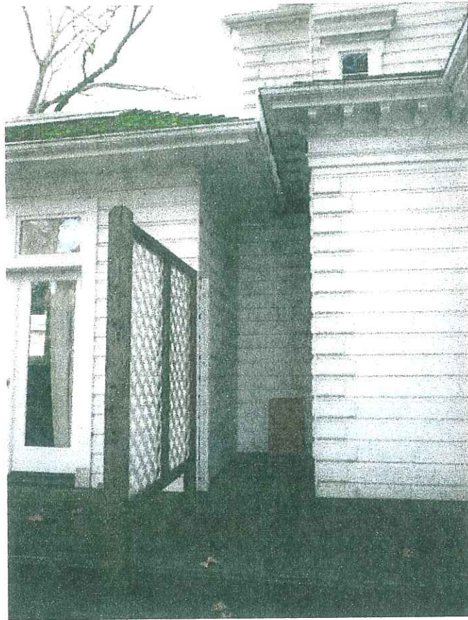
"Notch" to be filled in by new addition. Lattice fence to be removed