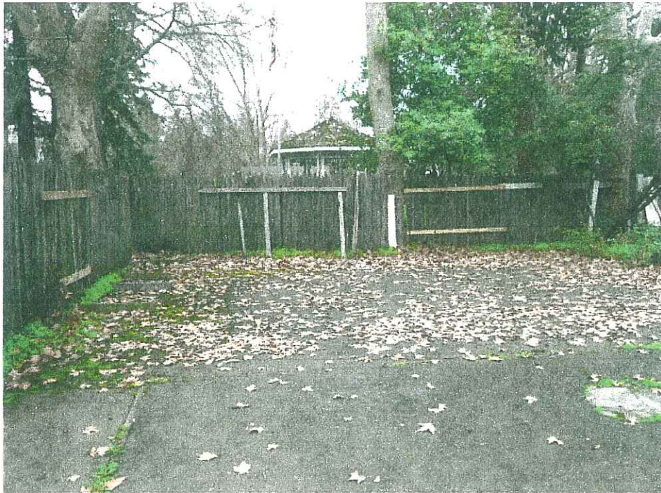
View of rear parking lot to be replaced with garden. Fence at left and in background to be replaced subject to agreement with City of Calistoga