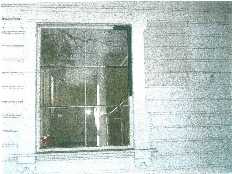
Window at north elevation to be replaced with conforming (one over one) wood window. Paint samples visible on window trim and siding to right of window