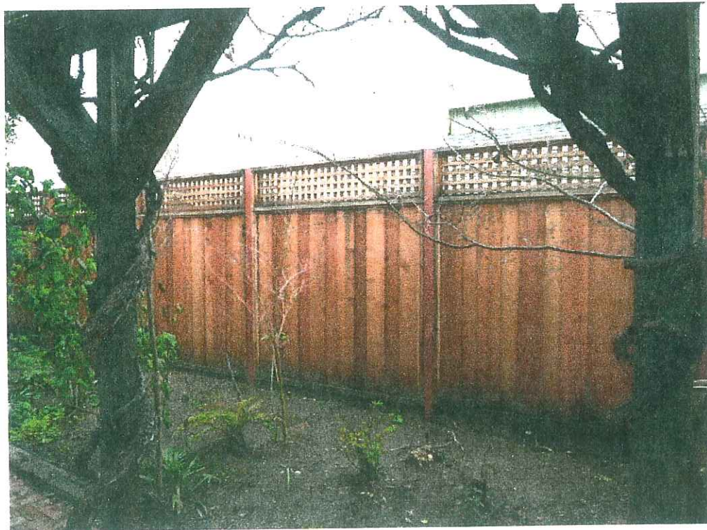
Example of proposed 8' fence (2' of lattice over 6' solid)