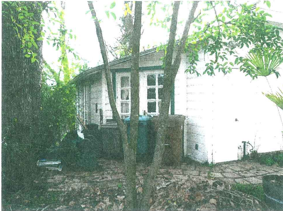
View of rear of carriage house that may be removed as part of riverbank erosion control program (no specifics for this program have been agreed upon)