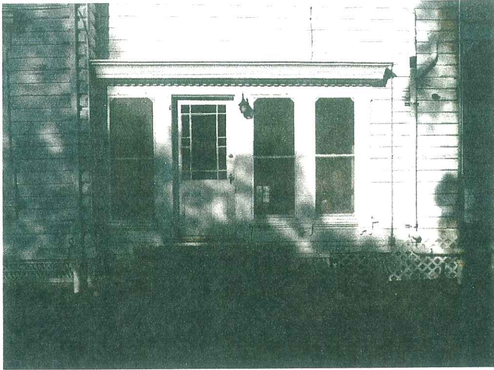
View of east elevation from outside family room. Window on left to be removed, and door, two windows to be replaced with conforming style (one over one) wood windows