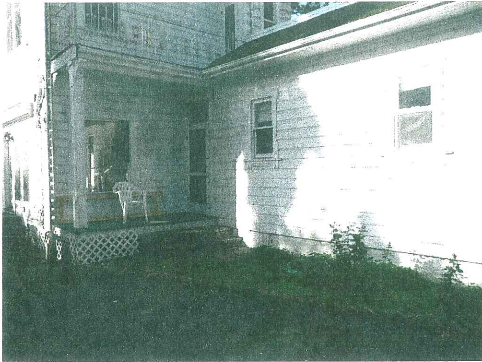
View of east elevation showing location of new deck extension from existing rear porch