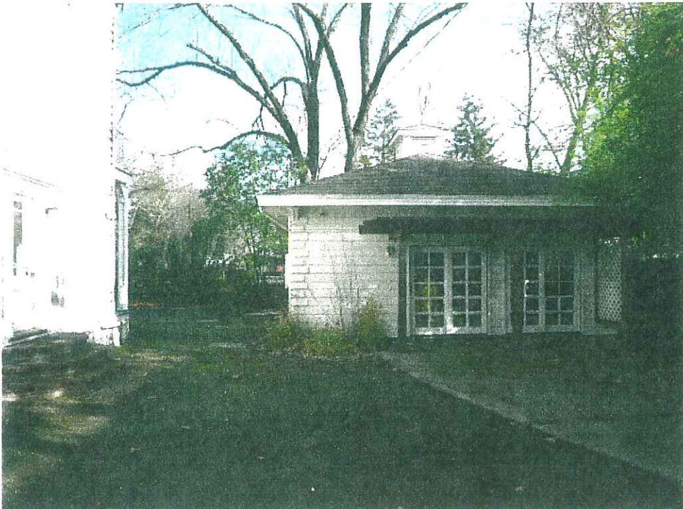
View of existing "carriage house" units (not a part of historic designation) to be converted back to garage